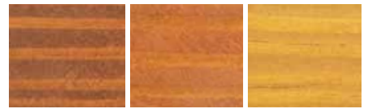
Jarroh Brown Mahogany Flame Natural