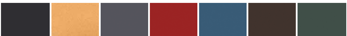
Matte Black Copper Penny Charcoal Gray Bright Red Gallery Blue Dark Bronze Classic Green