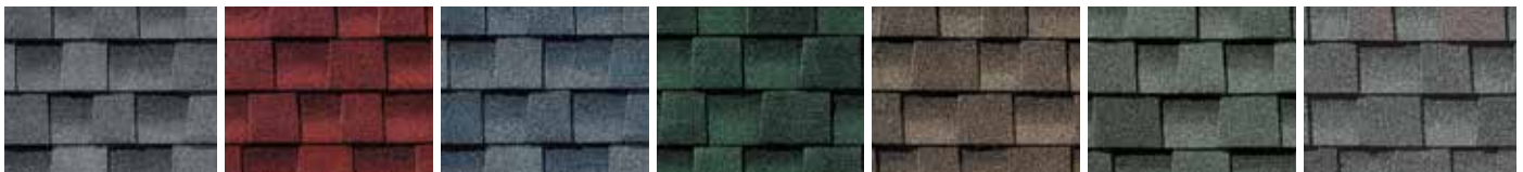
Oyster Gray Patriot Red Biscayne Blue Hunter Green Mission Brown Slate Williamsburg Slate