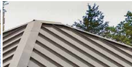
Standing Seam Metal (Deluxe Upgrade)