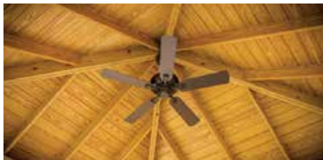
Stained Wood (Standard)