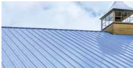
Standard Ribbed Metal (Premium Upgrade)