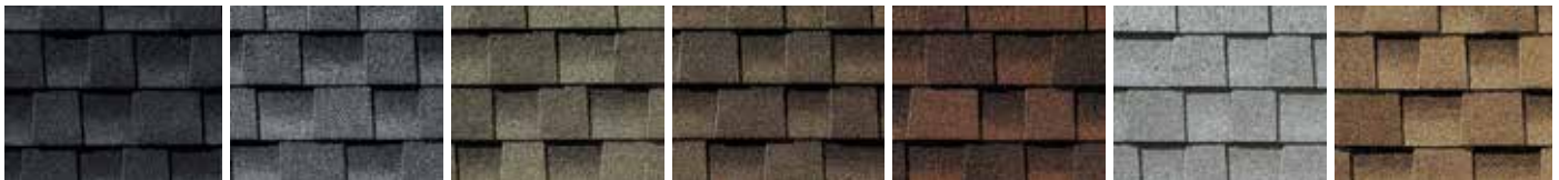
Charcoal Pewter Gray Weathered Wood Barkwood Hickory Fox Hollow Gray Shakewood